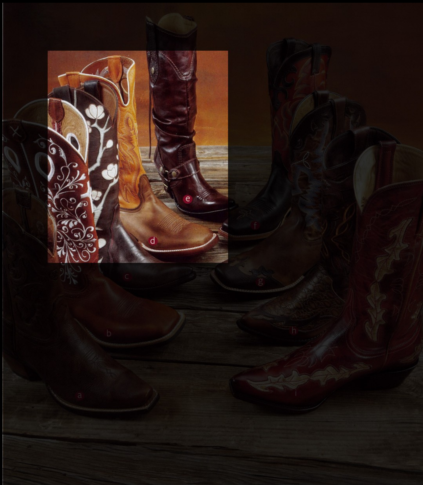
BOOTS —a) Ariat women's Shada, with ornate inlay shaft design, ariat.com b) Twisted X Boots women's Ruff Stock square toe, with embroidered cross and floral pattern, twistedxboots.com c) Caboots Cherry Blossom mule hide tri-ad cut, caboots.com d) Nocona Rust Ranch Hand square toe, nocona.com e) Lucchese, Harness slouch mahogany boot, lucchese.com f) Justin Boots Chocolate Cowhide square toe, justinboots.com g) Ariat men's Troubador, with wingtip and collar design h) Crush by Durango in dusk radiance, durangoboot.com i) Lucchese red Cowgirl-Laurel with ceramic inlays